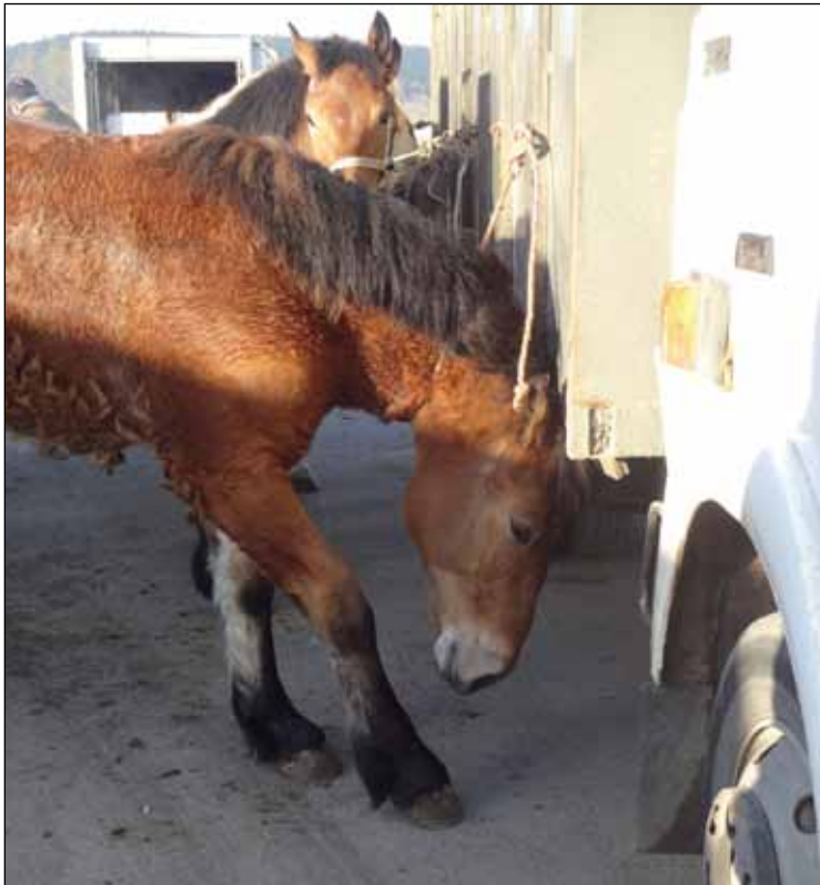
BODZENTYN, 22.04.2013: This horse is tied up only with a rope around his neck, causing a risk of injury and panic.