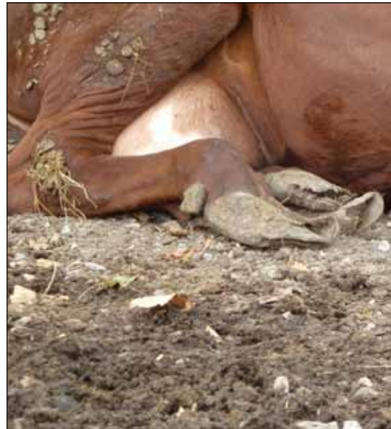
LAGOW, 12.09.2012: Thin cow with severely overgrown hooves.