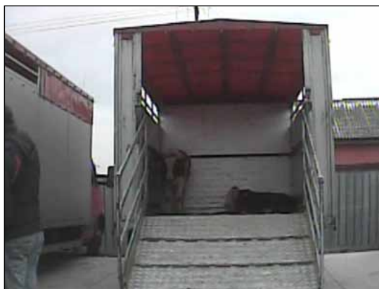
Stary Sącz, 27.11.2013: Animals remain loaded on a newly built, EU-funded market, which accepts too large number of animals and lacks space to tether them.