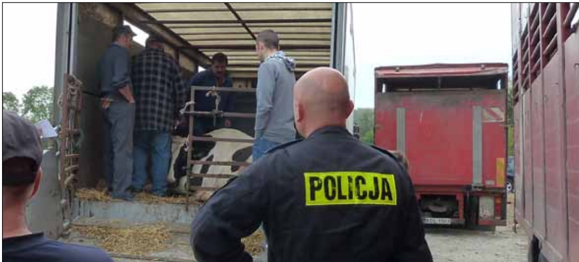
LAGOW, 12.09.2012: Downer cow Elsbietha has been dragged from one truck into another at Lagow market. We inform the police.

THE LAW REQUIRES: "... ANIMALS THAT ARE INJURED OR THAT PRESENT PHYSIOLOGICAL WEAKNESSES OR PATHOLOGICAL PROCESSES SHALL NOT BE CONSIDERED FIT FOR TRANSPORT AND IN PARTICULAR IF: THEY ARE UNABLE TO MOVE INDEPENDENTLY WITHOUT PAIN OR TO WALK UNASSISTED..." (EC Reg 1-2005, Annex I, Chapter I, Section 2 (a))