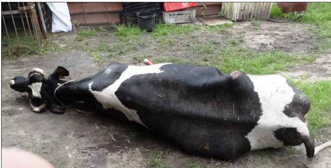
RADZYMIN, 28.06.2013: A truck with the downer cow Hope arrives at Radzymin market and is refused at the entrance. We inform the police. The truck returns to the farm of origin where Hope is pulled off the truck (see also chapter II.2b, page 46). Hope should have never been transported to the market.