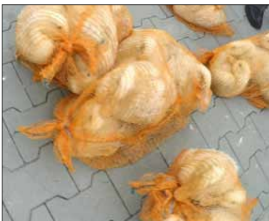
ZAGOROW, 08.04.2015: Ducklings in potato sacks.