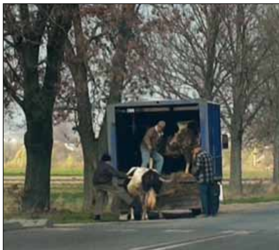
BODZENTYN, 03.11.2012: Kicking a cow during illegal loading outside the market.