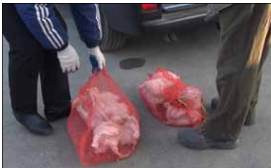
BODZENTYN, 22.04.2013: Chicken sold and carried in onion nets.