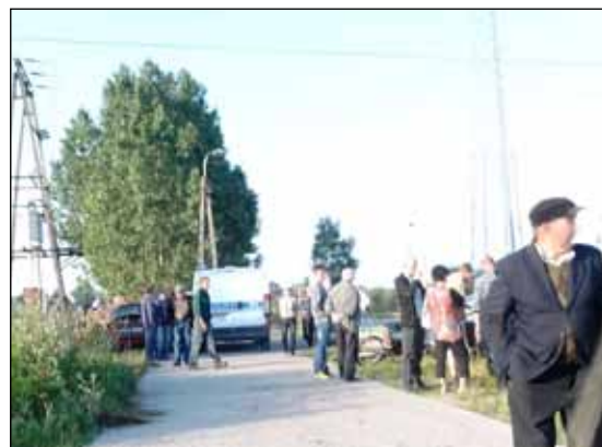
DOBRIŃ, 04.07.2013: Weekly illegal animal market.

One of the inspected markets, Dobrin, is illegal, not meeting any legal requirements regarding infrastructure and lacking veterinary supervision. The fact of this market being held is considered common knowledge and without any difficulties the team found out the market days and located the market grounds. This market takes place on a weekly basis without interference of local authorities. Only after we have informed the police, the illegal traders have been disbanded. According to our recent inspections, the market is no longer held.