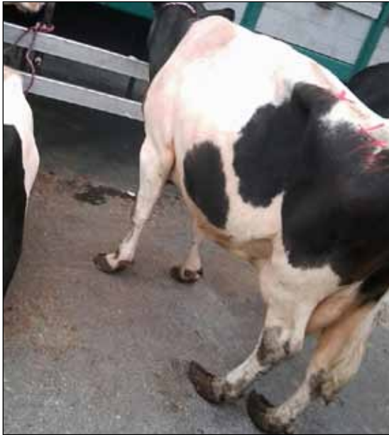
BODZENTYN, 06.07.2013: Cow Kindness suffers from severely overgrown hooves. Her body shows scratches and excoriations.