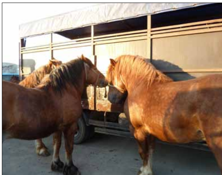
BODZENTYN, 22.04.2013: No water.