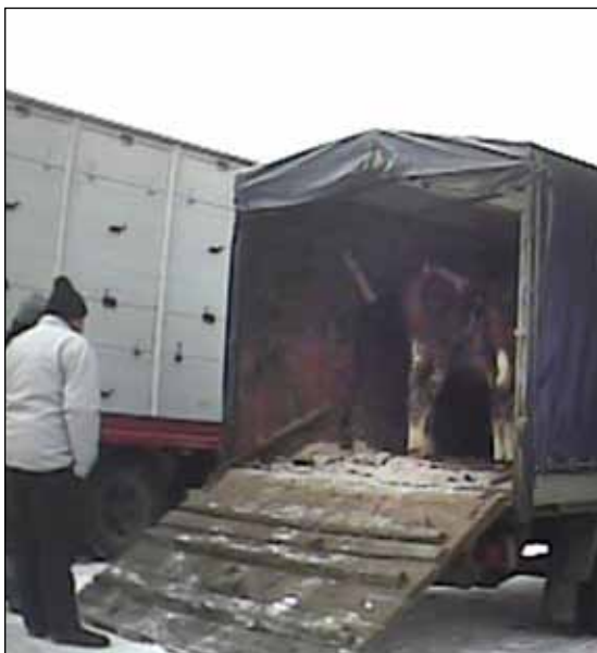
NOWY TARG, 28.11.2013: Horses remaining loaded during the market. The trailer is parked next to an empty holding shelter with plenty of space.

THE LAW REQUIRES: „ALL HOOFED FARM ANIMALS, EXCEPT PIGLETS UP TO 18 MONTHS, MUST BE UNLOADED FROM THE MEANS OF TRANSPORT AFTER HAVING ARRIVED AT THE MARKET.” (Polish market regulation, §4, Point 2)