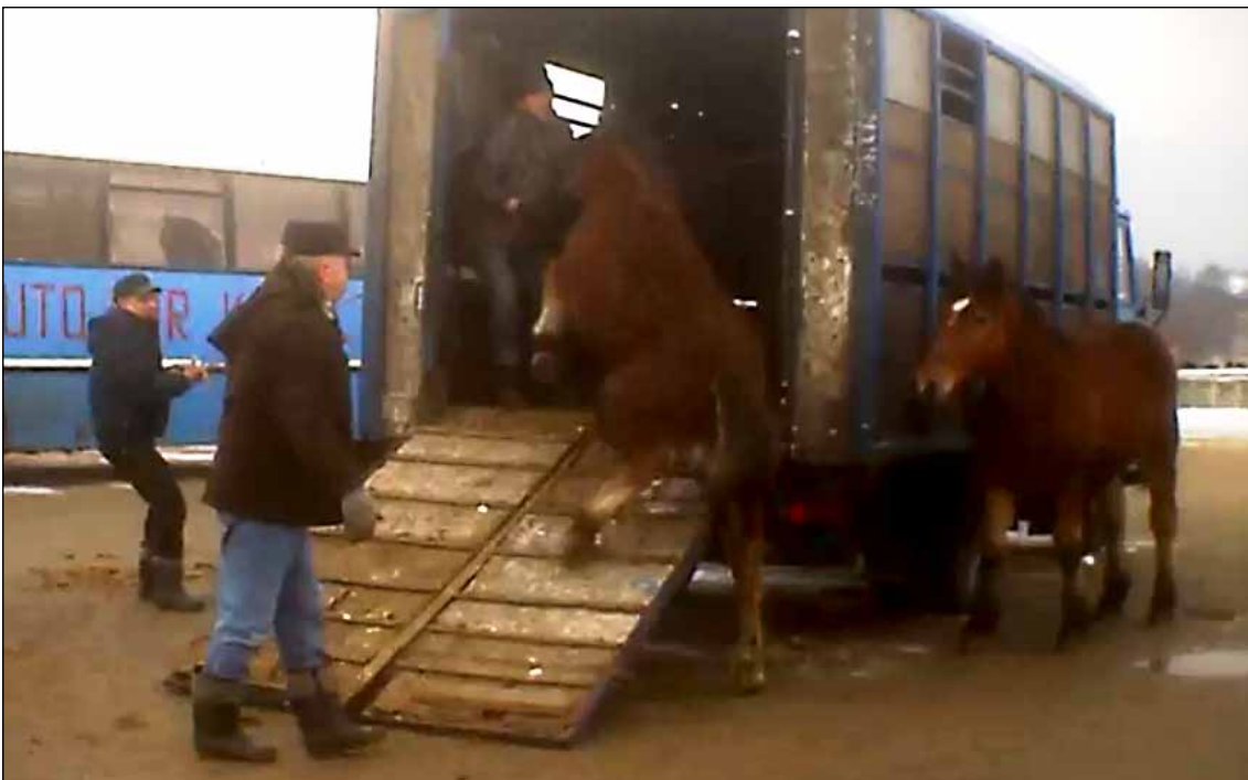
BODZENTYN, 18.01.2016: Horse Kali is pulled up a truck while several men hit him from the back. The ramp of the truck has no lateral protection. The men do not use the loading ramp of Bodzentyn market. Horse Kali keeps slipping off the side of the ramp.