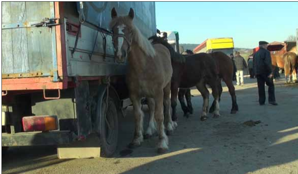
BODZENTYN, 22.04.2013: Animals tied to trucks. A common sight at every market.

THE LAW REQUIRES: "MARKETS OR ASSEMBLY CENTRES SHALL PROVIDE EQUIPMENT FOR TETHERING ANIMALS." (EC Reg 1-2005, Annex I, Chapter III, Section 1.10)