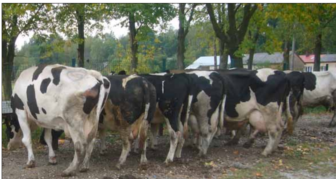
LAGOW, 12.09.2012: No water.

At none of the 23 market locations water is offered to the animals. This is particularly alarming during the hot summer months. A bull will drink up to 40-50 litres of water per day, cows in lactation double that, pigs have difficulty regulating their body temperature and rely on water, as well as adequate ventilation to survive in very hot temperatures. It is not acceptable that water is kept from the animals for such long periods of time, particularly as the market environment is stressful enough.