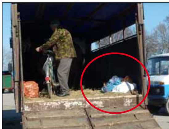
BODZENTYN, 22.04.2013: Birds are sold in onion nets, potato sacks and plastic bags. They are transported in trunks of cars and even on board of horse trucks.