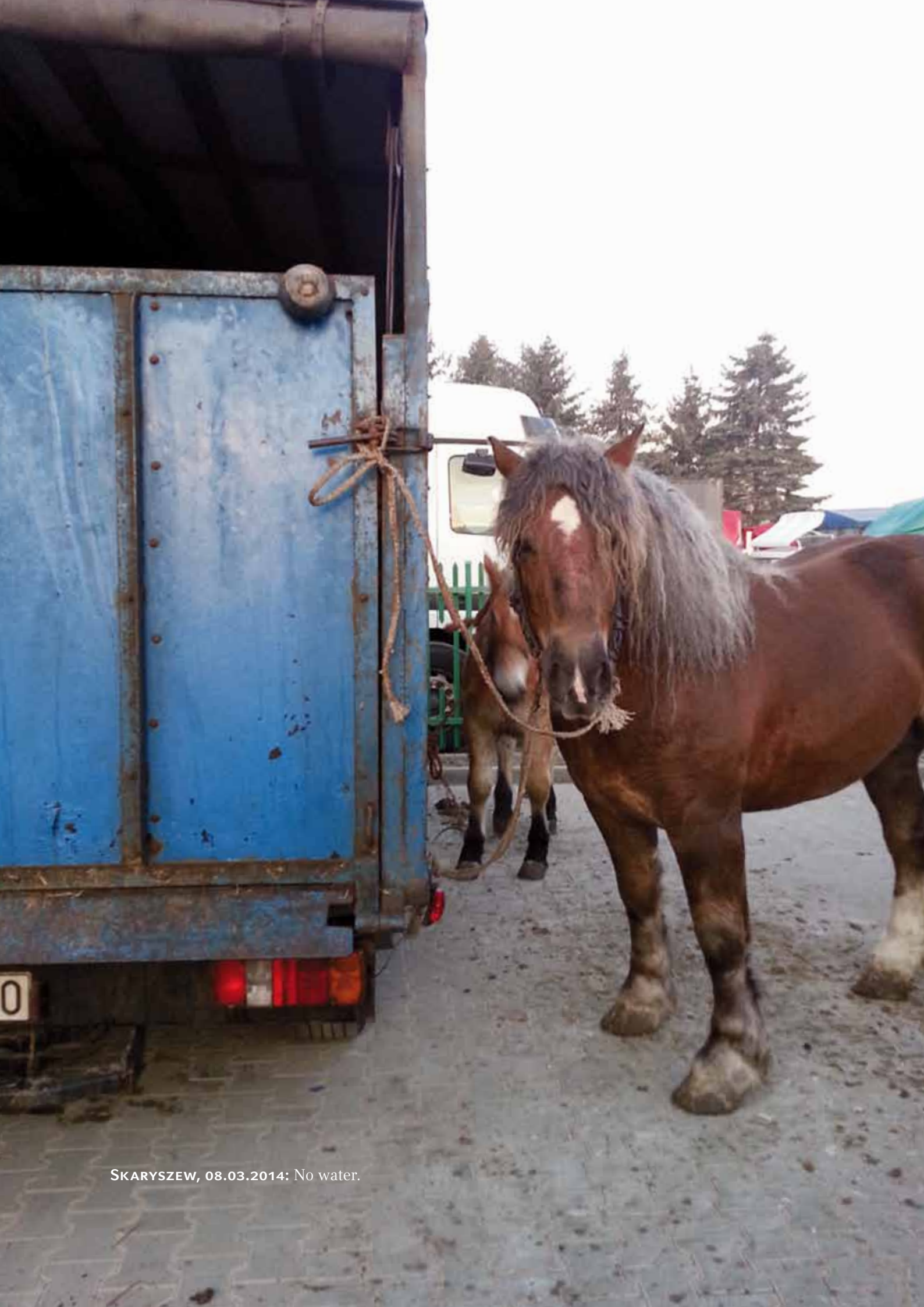
SKARYSZEW, 08.03.2014: No water.