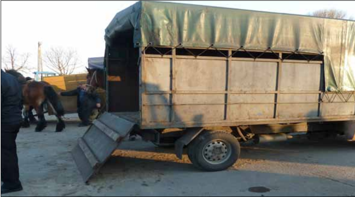
BODZENTYN, 22.04.2013: Steep ramp without lateral protection.