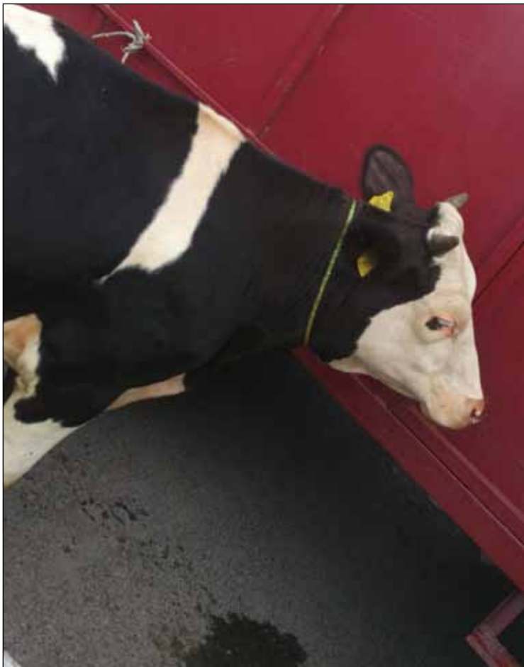
BODZENTYN, 20.07.2013: Cow Carla is tied up too tight with only a thin rope around her neck.