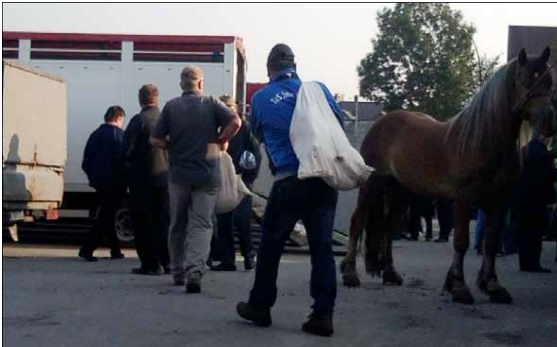
NOWY TARG, 18.07.2013: Piglets carried to a vehicle in sealed bags.