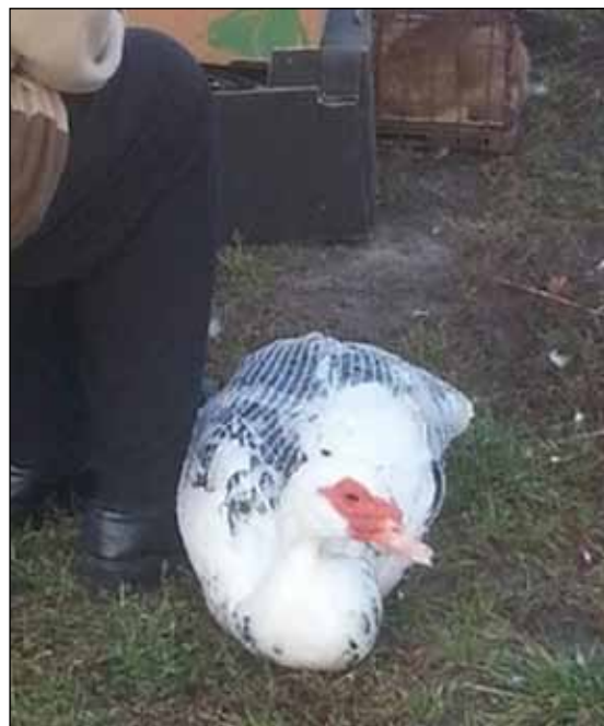
KOZLOW BISKUPI, 07.10.2014