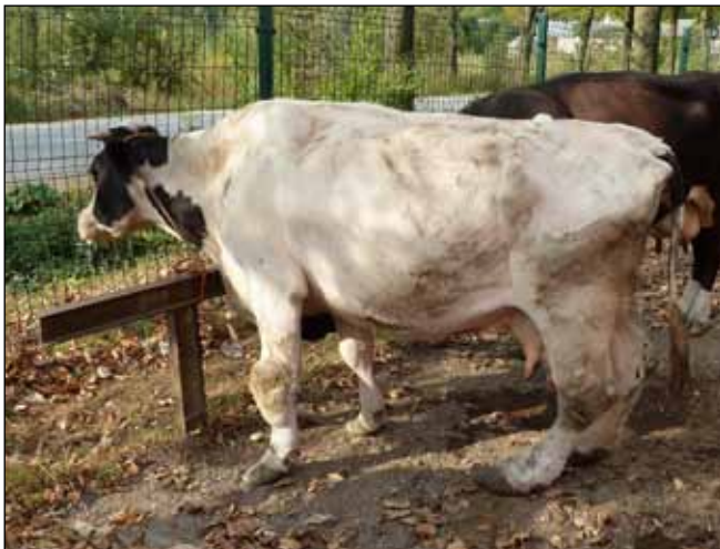
LAGOW, 12.09.2012: Cow Anna suffers from severely overgrown hooves, swollen joints and excoriations. Anna can barely walk.