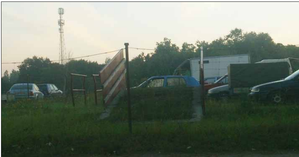
Golub-Dobrzyń, 30.08.2014: Unused ramp overgrown with grass.