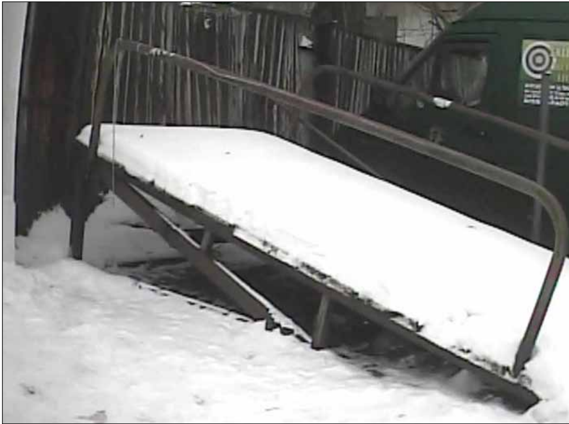
NOWY TARG, 28.11.2013: Loading ramp covered in thick snow and being located in the corner throughout the market.