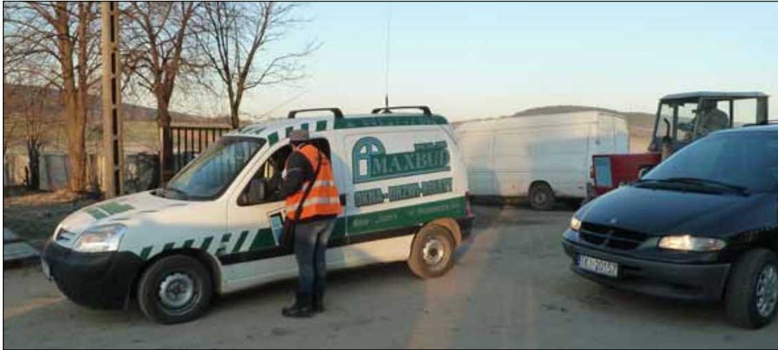
BODZENTYN, 22.04.2013: Collection of fees at the market entrance but no check of animals.

Animals' Angels has witnessed time and again that city council employees are only collecting entrance fees and allowing vehicles and animals onto the market grounds that violate the market legislation. The lack of thorough entrance checks is a failed opportunity to check if the vehicles and condition of the animals are in accordance with the relevant legislation.