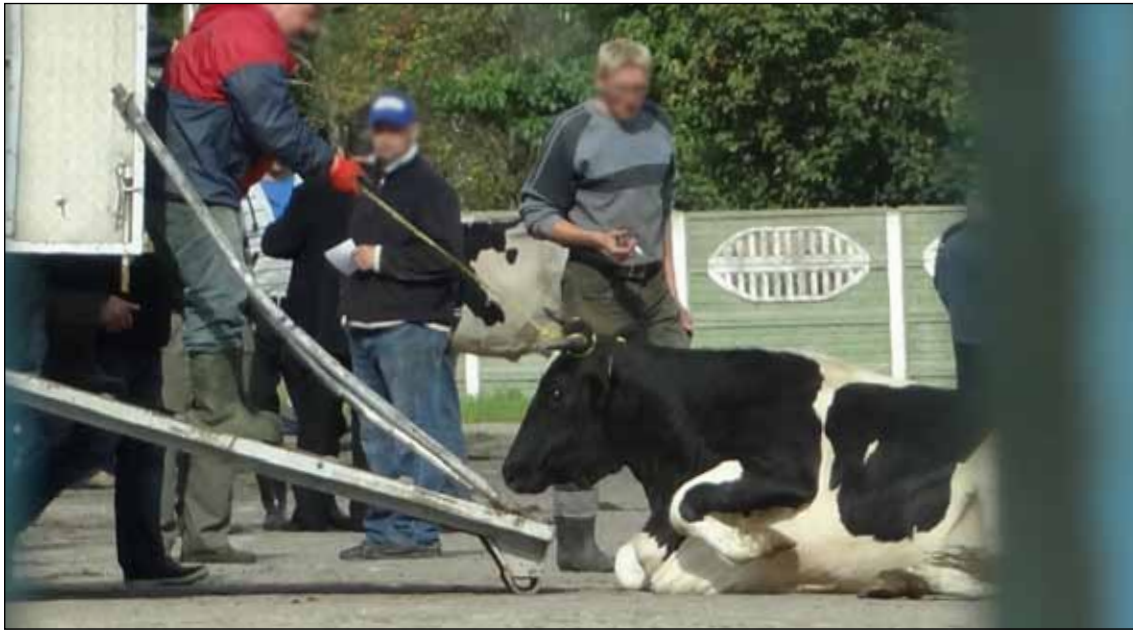
RADZYMIN, 10.09.2013: This bulls repeatedly slips on the floor during loading and falls to the ground. He is kicked excessively until he gets up again.

THE LAW REQUIRES: „ALL HOOFED FARM ANIMALS, EXCEPT PIGLETS UP TO 18 MONTHS, MUST BE UNLOADED FROM THE MEANS OF TRANSPORT AFTER HAVING ARRIVED AT THE MARKET.” (Polish market regulation, §4, Point 2)