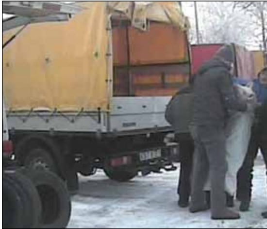
NOWY TARG, 28.11.2013: Piglets are sold in plastic bags.

THE LAW REQUIRES: "WHEN MOVING UNWEANED CALVES, LAMBS, GOAT KIDS AND PIGLETS, THE GREATEST POSSIBLE CARE SHOULD BE TAKEN AT ALL TIMES." (AEMB, market guidelines, 2014)