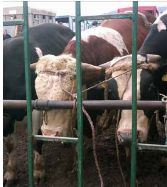
BODZENTYN, 06.07.2013: Cows tied up too short and by their horns. The animals are too close to each other and unable to lie down.