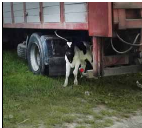
BODZENTYN, 06.07.2013: A young calf is tethered under a truck outside the market grounds.

At a large number of markets, animals are loaded, unloaded, and sometimes even traded outside of the market grounds. This happens in sight of authorities and other market users. All activities outside the market premises are undertaken without veterinary and market operators' supervision.