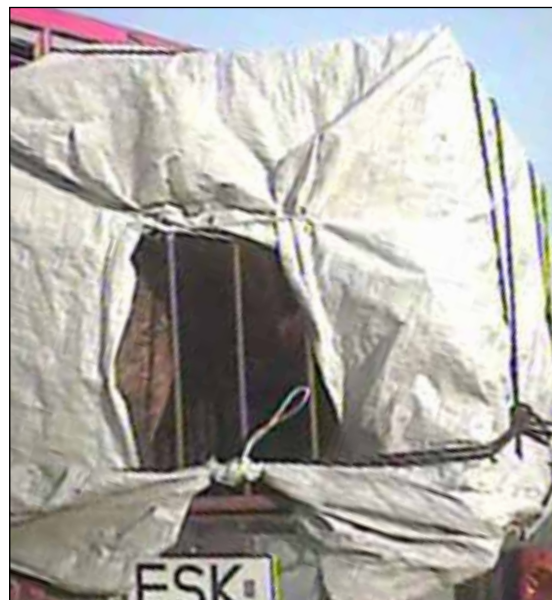
KOZŁOW BISKUPI, 17.10.2014: Calves covered up by plastic canvas. They remain loaded during the entire market.