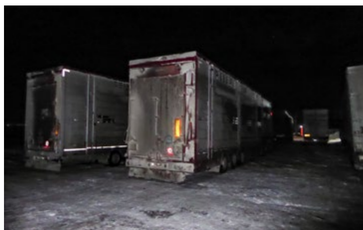
At minus 10°C, drivers' break on a TIR parking in Khromtau, Kazakhstan, for at least 8h with the pregnant animals on board, 20.02.2019

For details please see: https://www.animals-angels.de/mail/2019_Heifers_GER-UZB.pdf