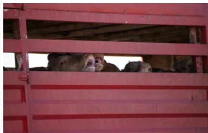
The calves are very hungry and show excessive tongue rolling behaviour during a driver's stop of 2h 15min. Transport of Czech calves to Turkey (reloaded on Turkish vehicle at the Turkish border), 20.08.2021.