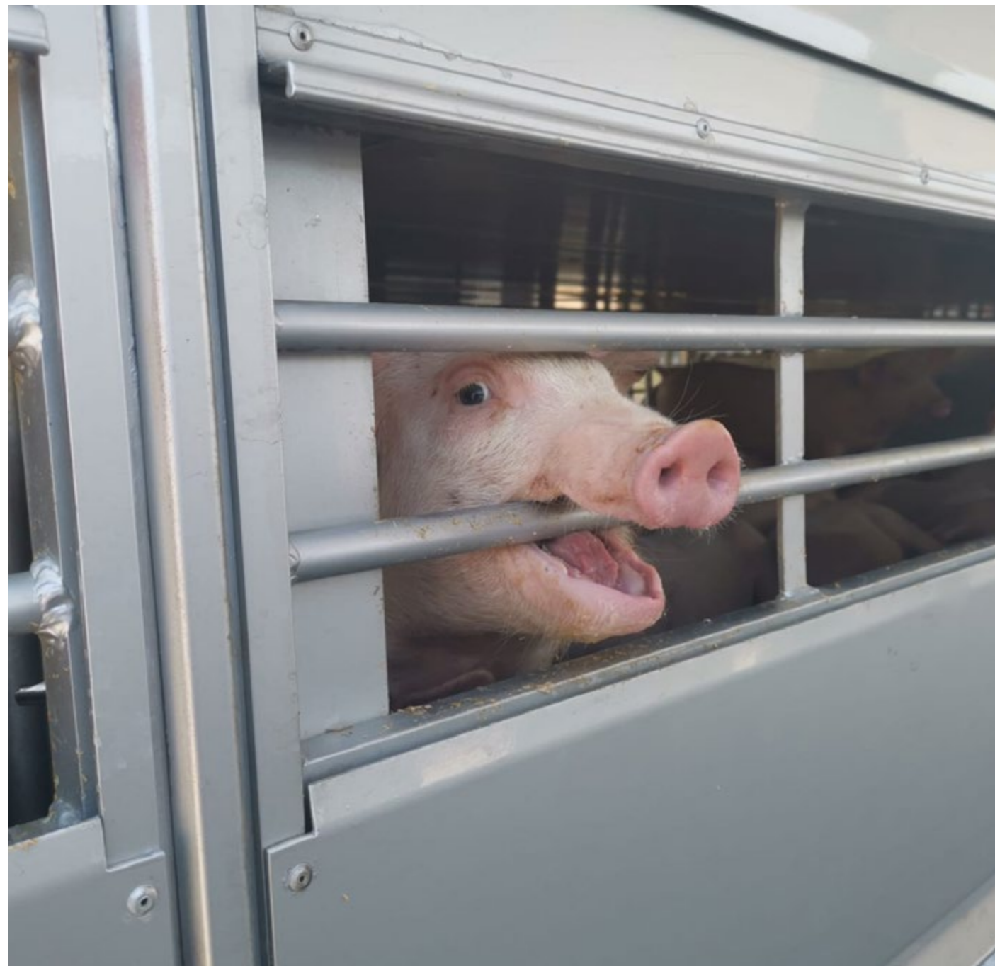
Danish piglets, transported to Italy in August 2022 - at temperatures up to 39°C and without continuous access to water. Near the final destination in Italy, the piglets were transferred onto a small vehicle to reach the farm. This reloading event caused a transport delay of nearly four hours for the young animals who were already suffering from heat stress.