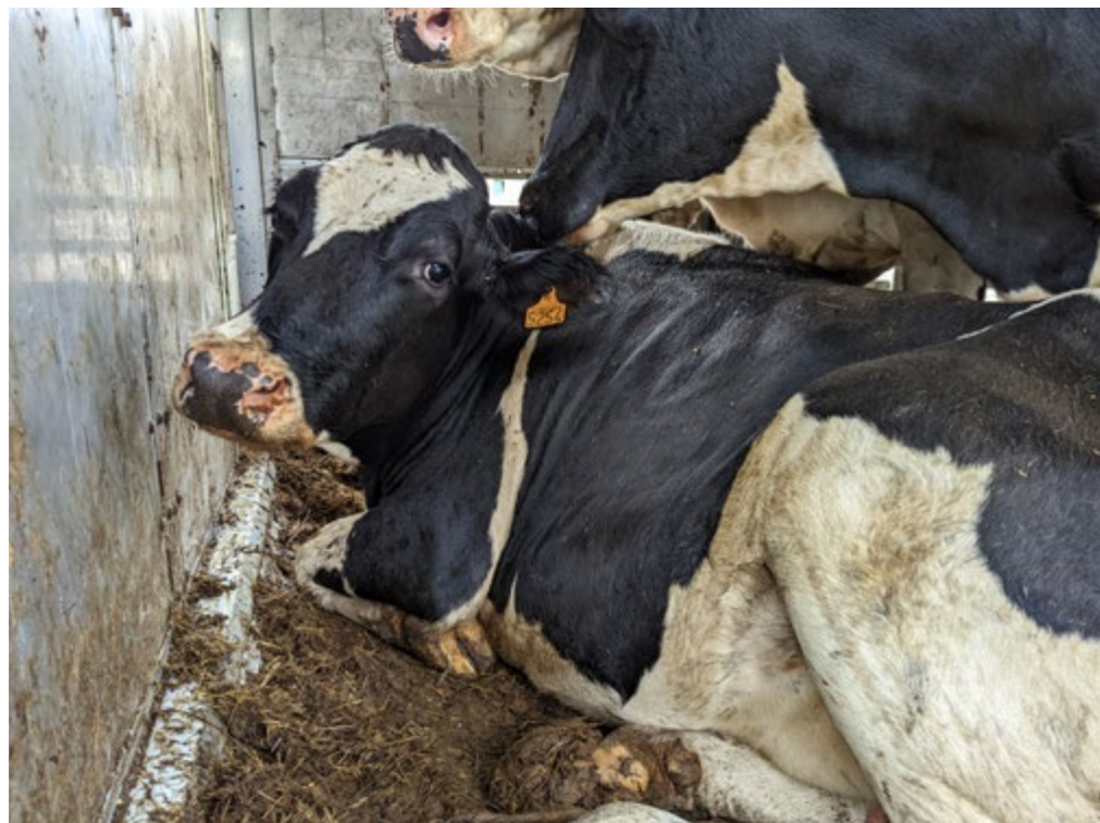
Transport of pregnant heifers from France to Gran Canaria - transport delay of nearly 10h. Berenice is extremely exhausted, 26.09.2022.