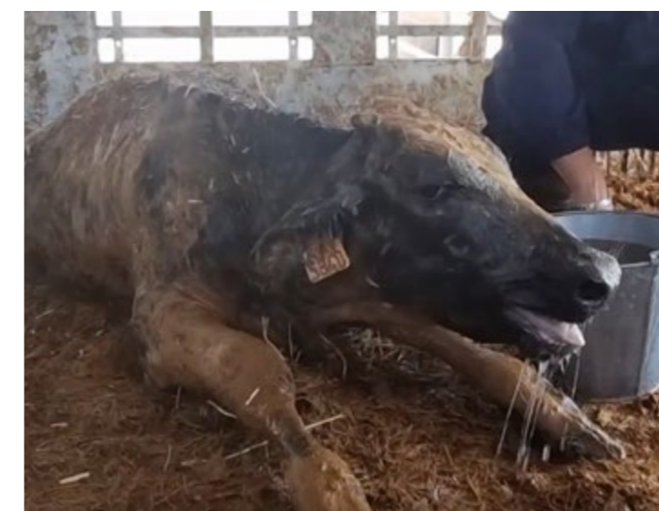
Transport of Spanish calves from Spain (Aragón) to Gran Canaria, 07.–10.10.2022. The transport had more than 12h delay with sick calf Magda on board (left). She was unable to stand up upon arrival to the destination suffering from severe breathing difficulties, exhaustion and possibly shipping fever.