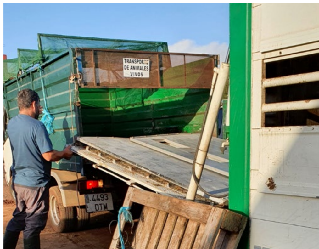
Preparations to transfer the animals from the big truck onto a small vehicle. Transport of 'feeder' calves from Aragon (Spain) to Tenerife (Canary Island), 10.10.2022.

→ For detailed information, please see: https://www.animals-angels.de/mail/2023_Letter_FR_Agriculture_Ministry.pdf